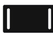
Card size: 38x20mm Hole size: 2x15mm