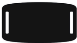
Card size: 50.8x28mm Hole size: 2x15mm