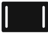
Card size: 39x25mm Hole size: 2x18mm