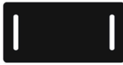
Card size: 50.8x25.4mm Hole size: 2x15mm