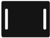
Card size: 35x26mm Hole size: 2x15mm