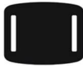
Card size: 33x26mm Hole size: 2x15mm